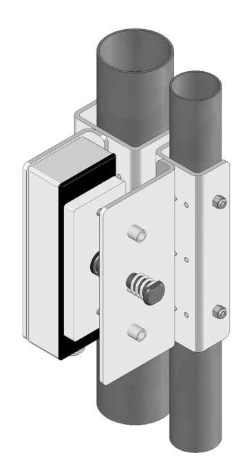
SASM on Sliding Gate Using Flex-Mount Bracket Kit FMK-SL

SASM on Swinging Gate Using Flex-Mount Bracket Kit FMK-SW