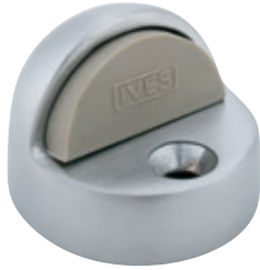
FS438 Meets ANSI/BHMA 156.16, L12141 for brass or bronze and L32141 for aluminum.