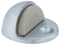
FS436 Meets ANSI/BHMA 156.16, L12141 for brass or bronze and L32141 for aluminum.